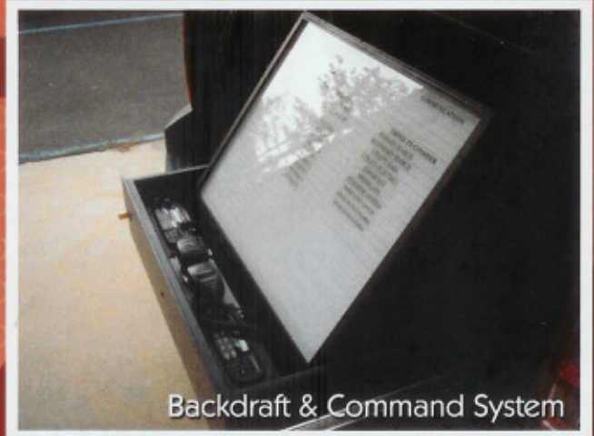
Backdraft & Command System