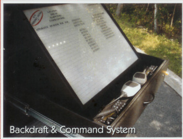
Backdraft & Command System