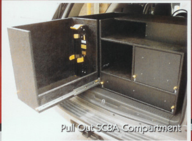
Pull Out SCBA Compartment